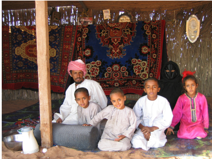
Figure 2: This photo shows a Bedouin family from eastern Oman. How will their society respond to the constraints modern society places on a nomadic lifestyle?