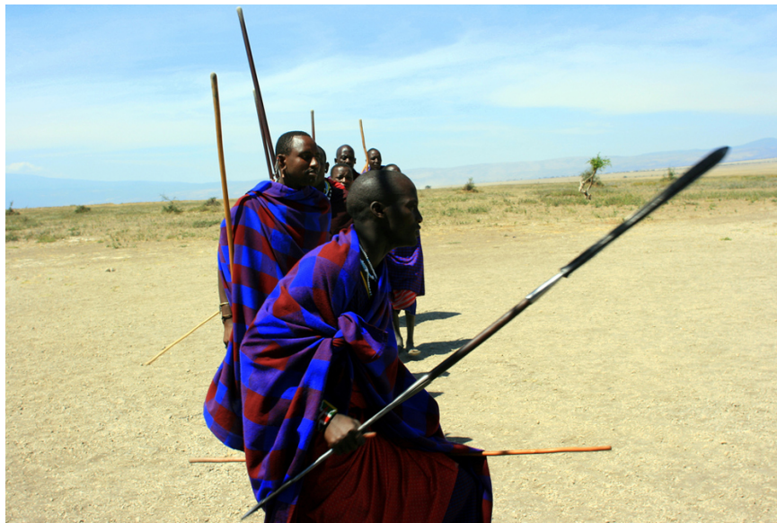
Figure 1: Maasai men are hunting with shepherd's staves and spears. How does technology influence a society's daily occupations?

Maasai villagers, Tehranians, Americans—each is a society. But what does this mean? Exactly what is a society? In sociological terms, society refers to a group of people who live in a definable community and