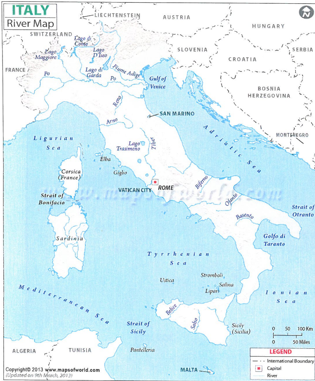
Resource Map #1 ↑