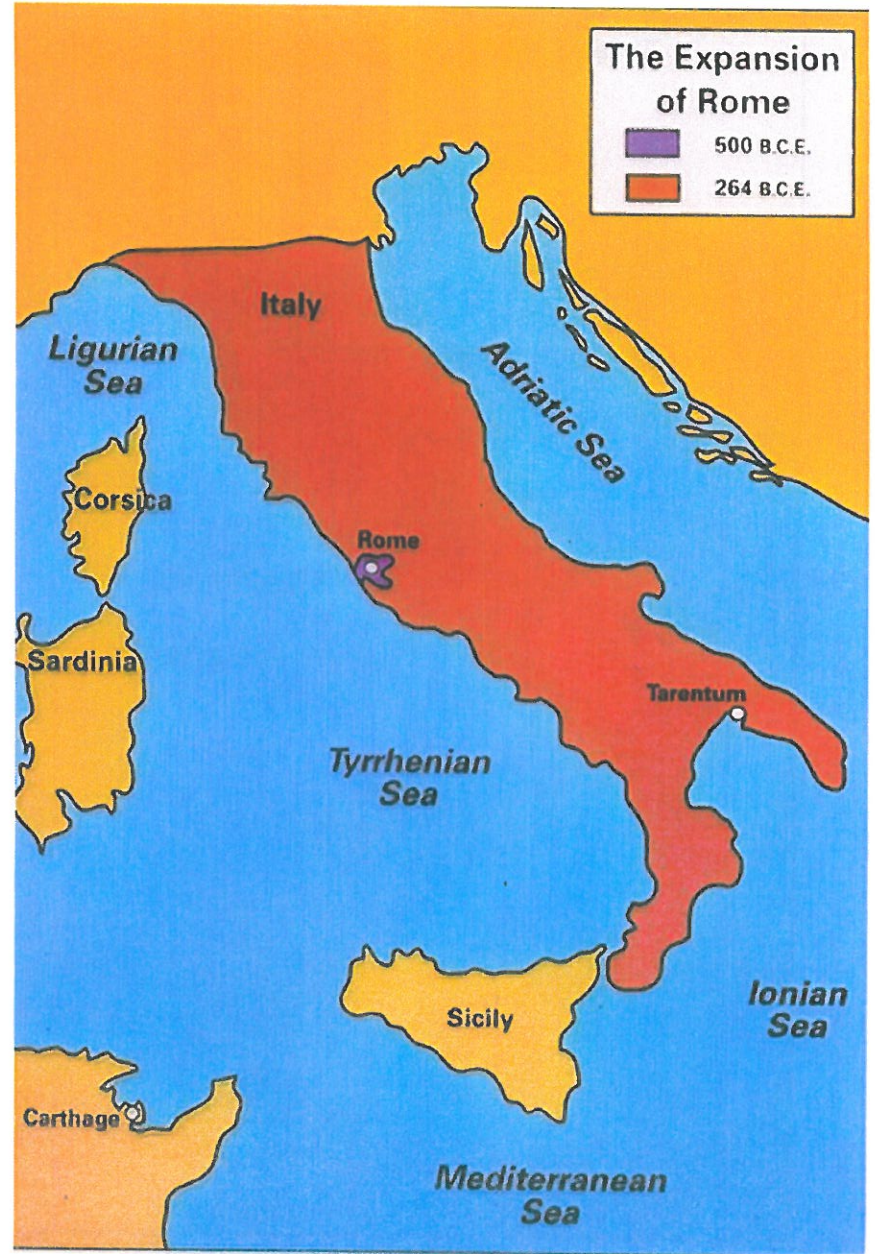
Resource Map #2 ↓